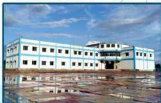
MANBAZAR GOVERNMENT ITI, MANBAZAR, PURULIA, WEST BENGAL