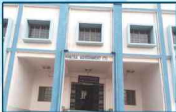
KHATRA GOVERNMENT ITI, KHATRA, BANKURA, WEST BENGAL