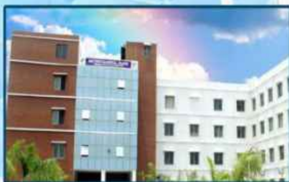
SANTINIKETAN MEDICAL COLLEGE, BOLPUR, BIRBHUM, WEST BENGAL