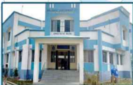
KALIGUNJ GOVERNMENT ITI, KALIGUNJ, NADIA, WEST BENGAL