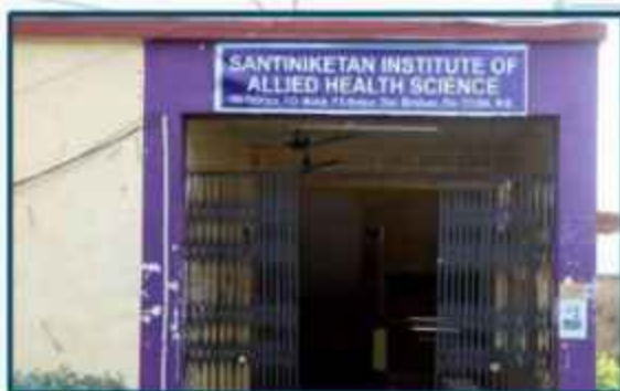
SANTINIKETAN INSTITUTE OF ALLIED HEALTH SCIENCE, TATARPUR, BOLPUR, BIRBHUM, WEST BENGAL