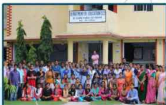
SANTINIKETAN D.ED. COLLEGE, BOLPUR, BIRBHUM, WEST BENGAL