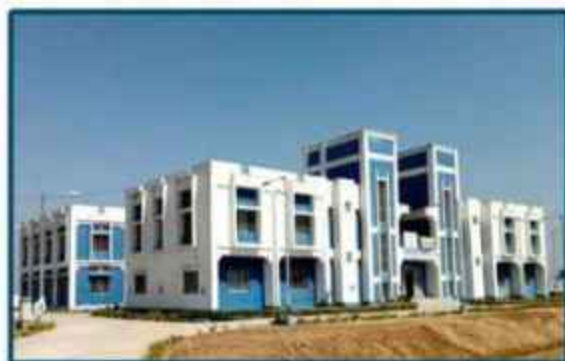
DUBRAJPUR GOVERNMENT ITI, DUBRAJPUR, BIRBHUM, WEST BENGAL