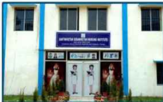
SANTINIKETAN SEBANIKETAN NURSING INSTITUTE, TATARPUR, BOLPUR, WEST BENGAL