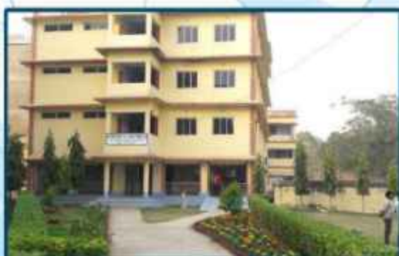
SANTINIKETAN B. ED COLLEGE, BOLPUR, BIRBHUM, WEST BENGAL