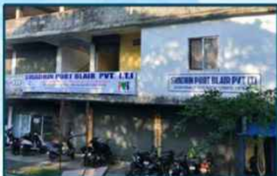
SWADHIN PORT BLAIR PRIVATE ITI, PORT BLAIR, ANDAMAN & NICOBOR