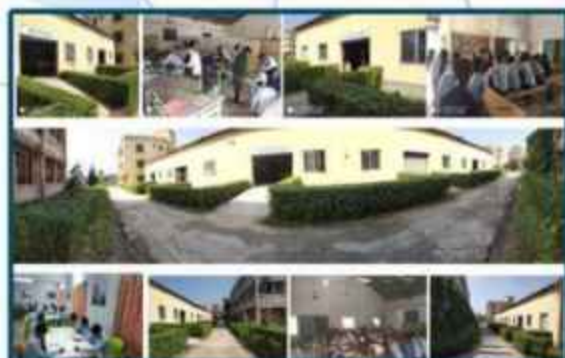
SANTINIKETAN PRIVATE ITI, BOLPUR, BIRBHUM, WEST BENGAL