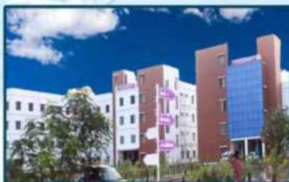
SANTINIKETAN PARAMEDICAL COLLEGE, GOBINDAPUR, BOLPUR, WEST BENGAL