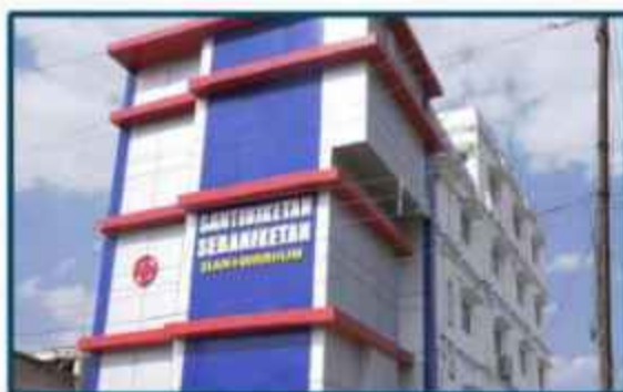
SANTINIKETAN SEBANIKETAN, SIAN, BOLPUR, BIRBHUM, WEST BENGAL