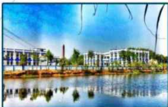
ILLAMBAZAR GOVERNMENT ITI, ILLAMBAZAR, BIRBHUM, WEST BENGAL