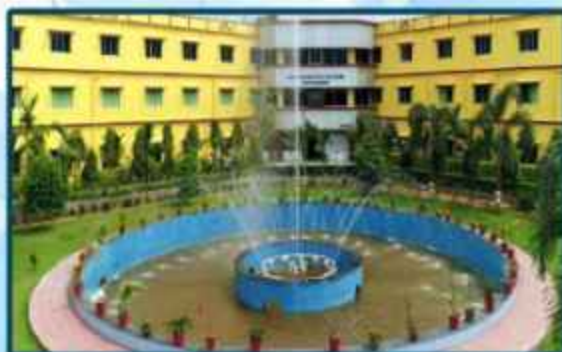
SANTINIKETAN INSTITUTE OF POLYTECHNIC, BOLPUR, BIRBHUM, WEST BENGAL