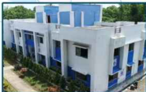
NAKASHIPARA GOVERNMENT ITI, NAKASHIPARA, NADIA, WEST BENGAL