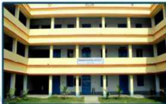
SWADHIN NURSING INSTITUTE, BOLPUR, BIRBHUM, WEST BENGAL