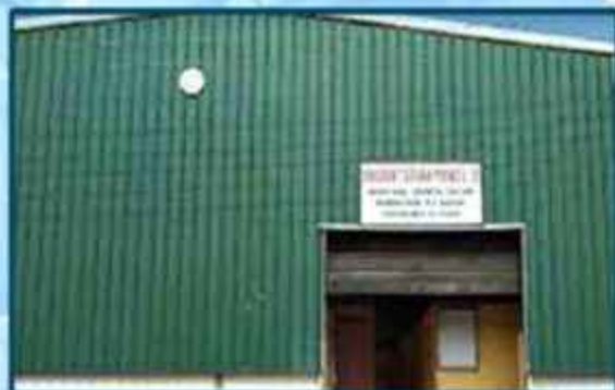
SWADHIN TRIPURA PRIVATE ITI, BAMBOO PARK, TRIPURA WEST