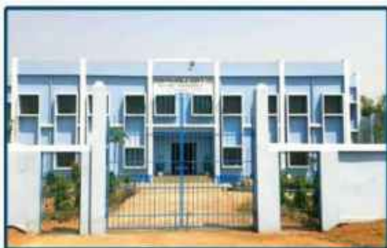
KHOYRASOLE GOVERNMENT ITI, KHOYRASOLE, BIRBHUM, WEST BENGAL