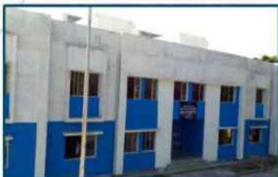
DINHATA GOVERNMENT ITI, DINHATA, COOCH BEHAR, WEST BENGAL