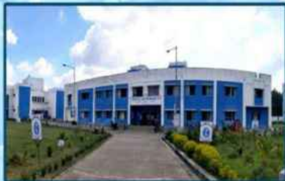
TEHATTA GOVERNMENT ITI, TEHATTA, NADIA, WEST BENGAL