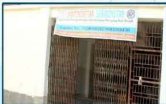
SANTINIKETAN SEBANIKETAN UNIT -II, MULUK, BOLPUR, BIRBHUM, WEST BENGAL