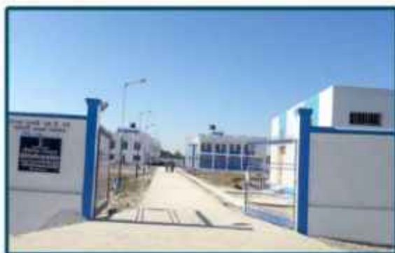
MATHABHANGA GOVERNMENT ITI, MATHABHANGA, COOCH BEHAR, WEST BENGAL